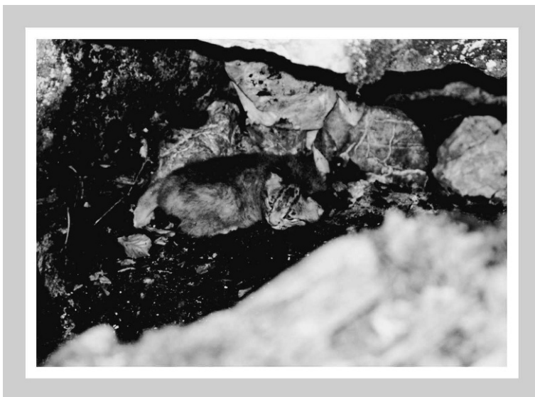
Figure 2. Natal den in a rock cleft (showing a kitten of female F34 in 2000). This is a rather typical situation since 65% of the dens were made of rock.

To avoid pseudo-replication, two dens, which were used by two females in two consecutive years, were considered only once for the analyses of microstructure and parameters describing the immediate surroundings. Two more sites were considered only once for the analyses of the topographic and strategic situation, because the females had used immediately neighbouring dens in consecutive years. Furthermore, for some den sites, we knew the location (because the female was repeatedly located at this place), but not the actual site (because the female had moved the litter before we could visit it). This leaves us with a basic sample size (see Table 1) of 42 for the microstructure and 66 for the macrostructure analyses. To test whether females had chosen consecutive dens according to individual preferences for specific den sites or habitat structures, we compared the different dens of the single females among themselves before running the subsequent analyses. We did not detect any particular preferences, except for the above-mentioned four pairs of identical dens/sites, which were exclud-