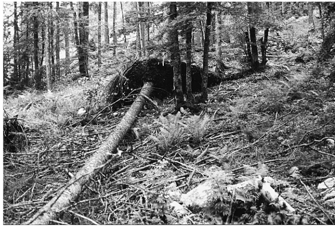
Figure 3. Maternal den site of female F21 in 1992 placed in the root stock of an overthrown tree; a rather atypical den site, lying in flat terrain (15°), providing little shelter and being easily accessible. Nevertheless it represents a maternal den site fairly well, since there were several hiding places around it.

ed once. However, the fact that a female chose the same den site again may indicate that this was a particularly ideal site. Furthermore, we examined whether daughters chose similar denning sites as their mothers, but did not find any concordance.